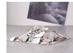
David Raffini 1m2 de gravats , 2015 Rubbish 100 x 100 cm