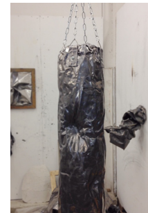
Florian Pugnaire Sans titre (plomb) , 2015 Plomb, chaines H : 130 cm