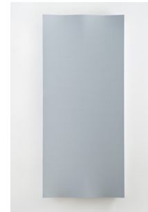
Jennifer Boysen Untitled , 2015 Tempera and pigment on canvas 213.4 x 93 x 10.2 cm